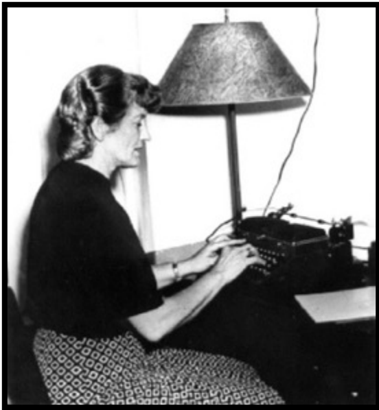
ABOVE: Mari Sandoz at work in Bernard Hall for the 1948 Writer's Institute at the University of Wisconsin at Madison.

Mari Sandoz attributed her writing success less to natural talent and more to hard work and determination (and lots of revision). She explored sweeping ideas and concepts related to the human drama, particularly as it played out on the landscape of the American West, depicted across multiple genres including ten books of nonfiction, seven novels, numerous essays, short stories, letters and collected writings. She was also a devoted writing teacher, reading and responding to the work of emerging writers of her time.