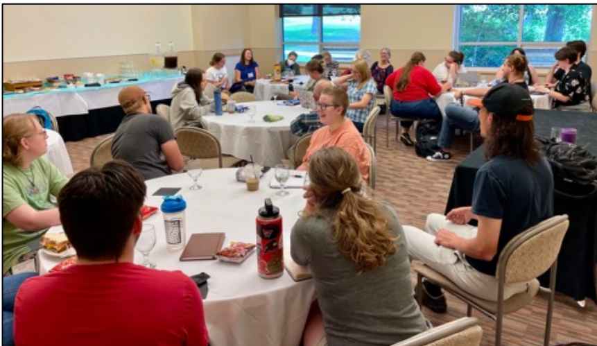
Writers gather for our lunch roundtable discussion at Story Catcher 2022 in Gunnison