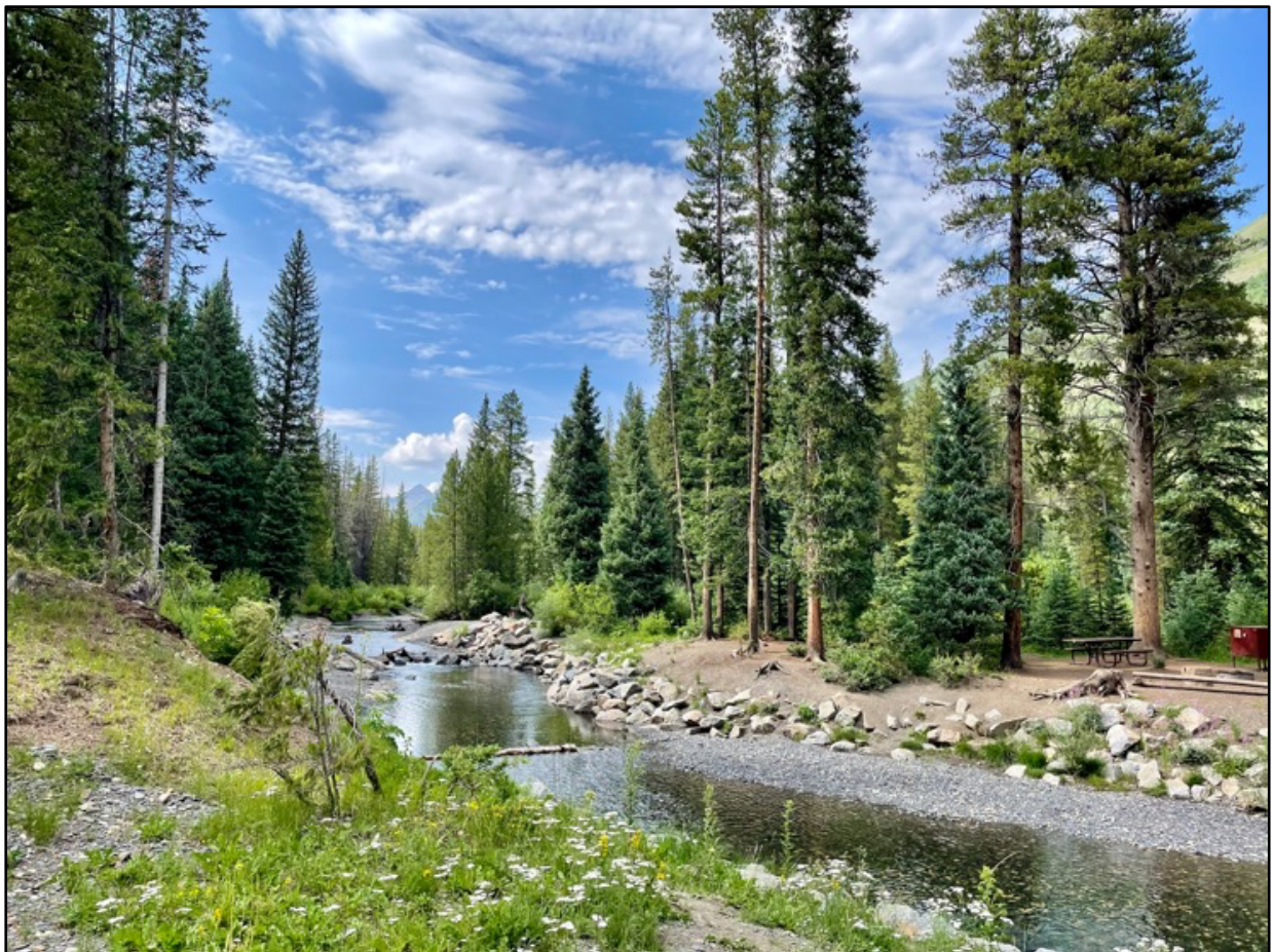
ABOVE (L-R) Festival participants at Story Catcher 2022 on the WCU Campus. MFA Students in the Nature Writing Concentration gather for a wildflower hike at the end of their 2021 summer residency. Slate River along "Oh Be Joyful" Trail, Grand Mesa National Forest, Crested Butte.

Set in the heart of the Rocky Mountains, with the Western Colorado University Campus as our classroom, and the Gunnison Valley, Crested Butte and Grand Mesa National Forest as our playground!